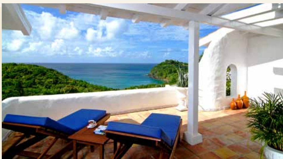
The quintessential Caribbean view from a villa at Windjammer Landing Villa Beach Resort