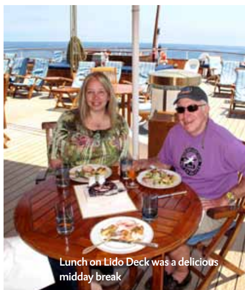
Lunch on Lido Deck was a delicious midday break

My favorite experience aboard was the actual sailing of the ship and the full day spent at sea. Unlike other sailing ships in the cruise market, the Sea Clouds are manually sailed. That means when they decide to set