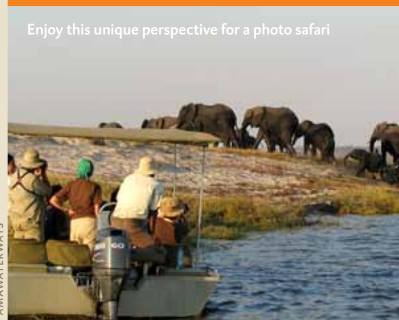
Enjoy this unique perspective for a photo safari