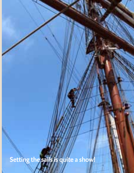
Setting the sails is quite a show!

Sea Cloud II keeps the dining experience simple, unlike typical large cruise ships. It's more like dining aboard a private yacht. But don't confuse simplicity with lack of qual- ity or originality. At breakfast we enjoyed a combination of an international buffet and the usual a la carte menu of omelets, eggs to order, and pancakes. Frankly, the buffet selections of fresh fruit, smoked salmon, trout and duck breast, cold cuts, multiple cheeses, and more was so diverse and of such quality