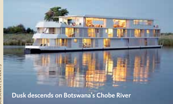
Dusk descends on Botswana's Chobe River

Rates include all lodgings, most meals with complimentary wine and beer at lunch and dinner, game drives, special excursions and dinners, a Victoria Falls National Park tour, and complimentary laundry service. International and intra-Africa airfare not included. For complete details and itinerary, visit www.Hideaways.com/africansunsets , or call Hideaways Travel Services at 800-843-4433.