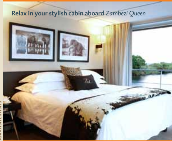
Relax in your stylish cabin aboard Zambezi Queen