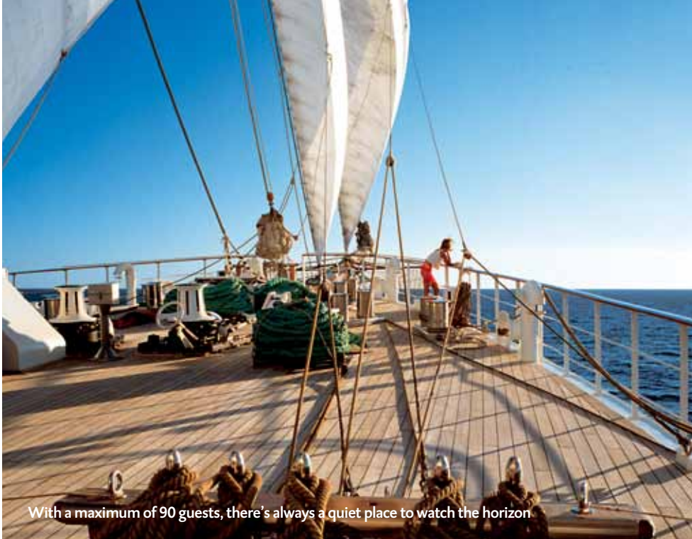
With a maximum of 90 guests, there's always a quiet place to watch the horizon

Inside, she's every bit as elegant and simple. A gracious dining room is lined with windows for a panoramic view. A top deck