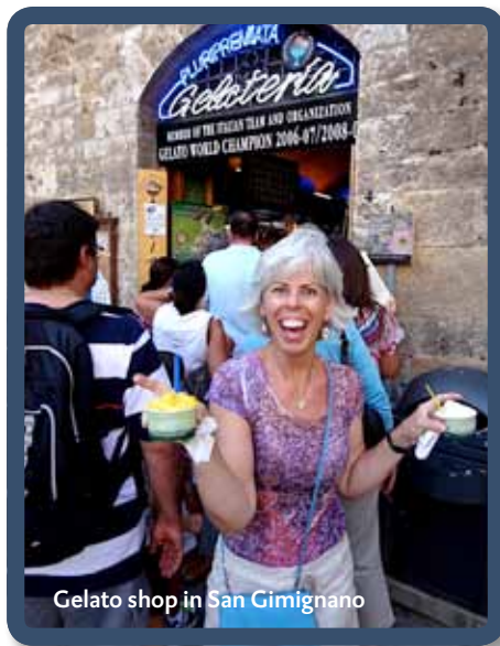
Gelato shop in San Gimignano