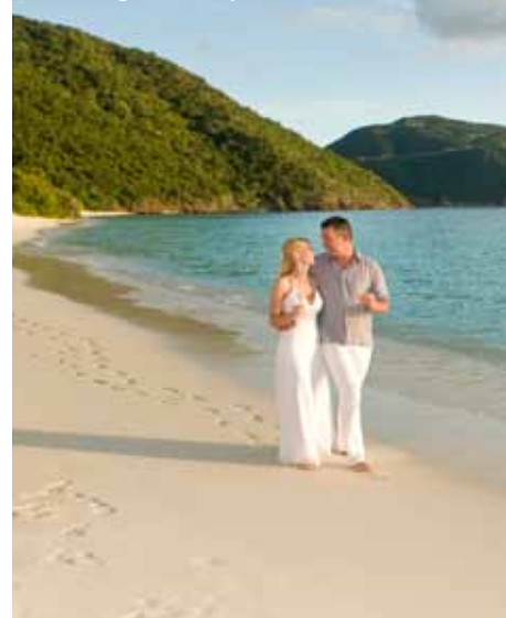
Strolling White Bay Beach on Guana Island

In the Negril area, Rockhouse Hotel is a unique boutique property clinging to the cliffs of Pristine Cove. Here again, you can