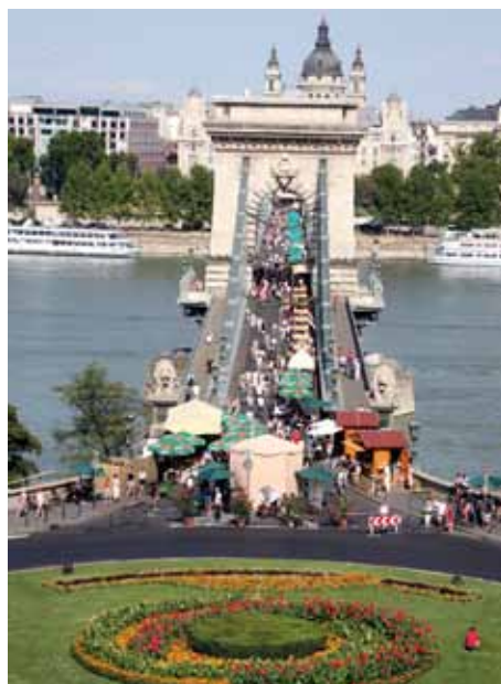
BUDAPEST'S FAMOUS Chain Bridge, first opened in 1849, connects the Buda and Pest sections of the city and is a lively place on market days.

BEAUTIFUL BUDAPEST — Always a popular port call for river cruisers, Budapest is an affordable European city with spectacular architecture and a fascinating history. Be sure to visit Matthias Church on Castle Hill, built in 14 th -century Gothic style, and pause